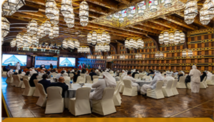
High-Level Conference Sessions