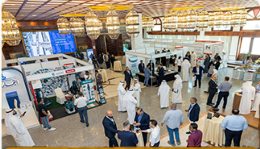
Dynamic Exhibition Area