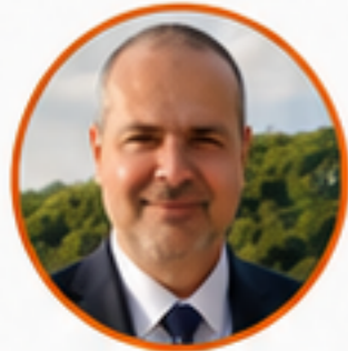
YOUR INSTRUCTOR مقدم الورشة