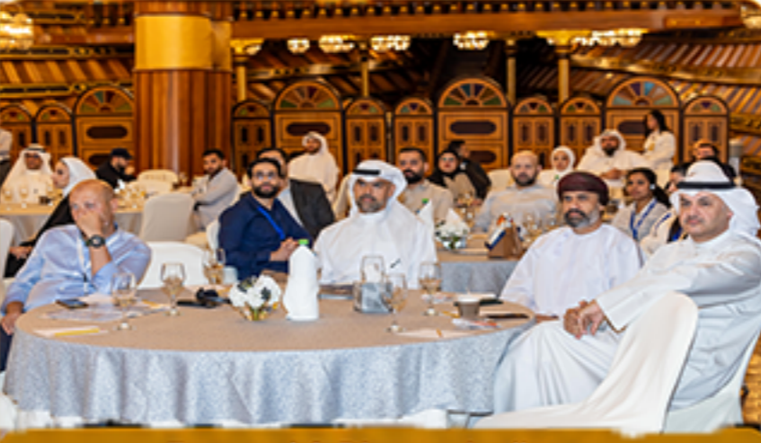
Engaged & Diverse Audience