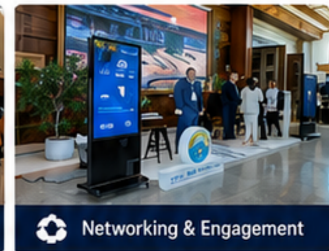
Networking & Engagement