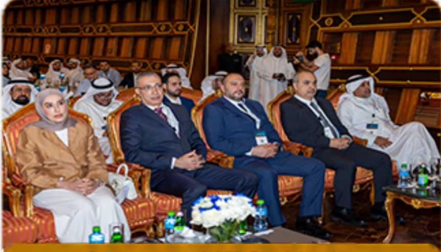
Government & VIP Participation