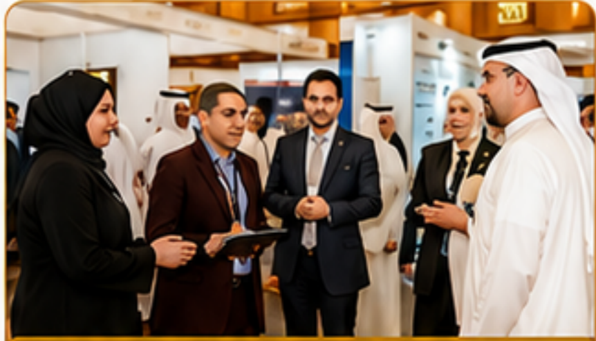
Networking & Business Opportunities