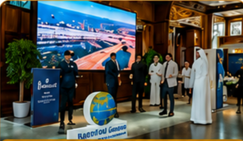
Leading Sponsors Showcase